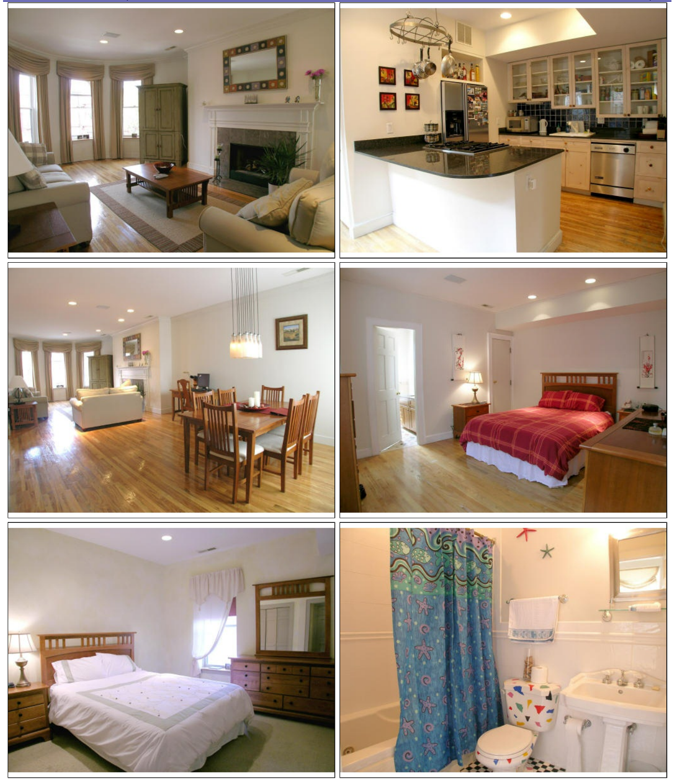
Condominium List Price: $849,000